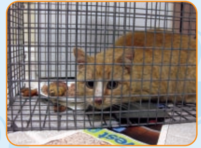
This wide-eyed kitty came with a full meal!