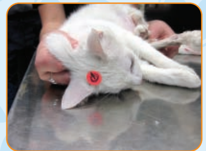
Kitty "Q" gets ready for his surgery.